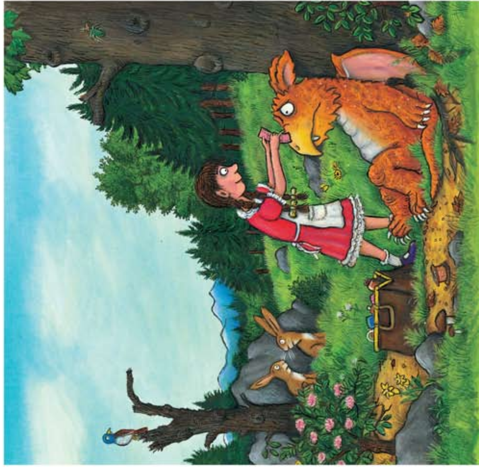
Taken from ZOG by Julia Donaldson and Axel Scheffler

Answers: In the right-hand picture, Pearl's dress has changed colour from blue to red. Zog's horn is missing from his head. One of the rabbits has lost his ears. Pearl's shoe has changed colour. One of the birds is missing from the tree, and the scissors are missing from the ground.